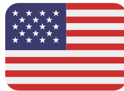
U.S. BORN, ENGLISH DOMINANT