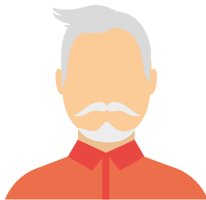
OLDER, MORE MALE

Latinos who voted for Trump were more likely to prioritize America-first values, Christian ideals, jobs and the economy. The Trump campaign mantra about keeping businesses open and people employed no matter what appealed to Latinos who believe work should carry on come rain or shine. Trump attracted many working class Hispanics affected by coronavirus-related job losses, pay cuts and small business declines by raising economic concerns to the top of the list.